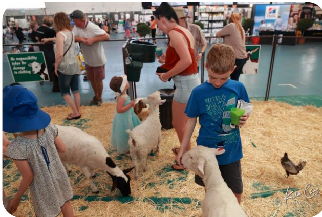
Swan Valley Animal Cuddly Farm to entertain the kids