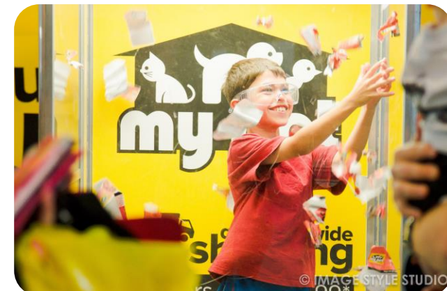
And much MUCH more!