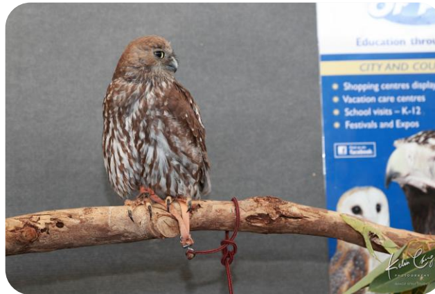
WA Birds of Prey