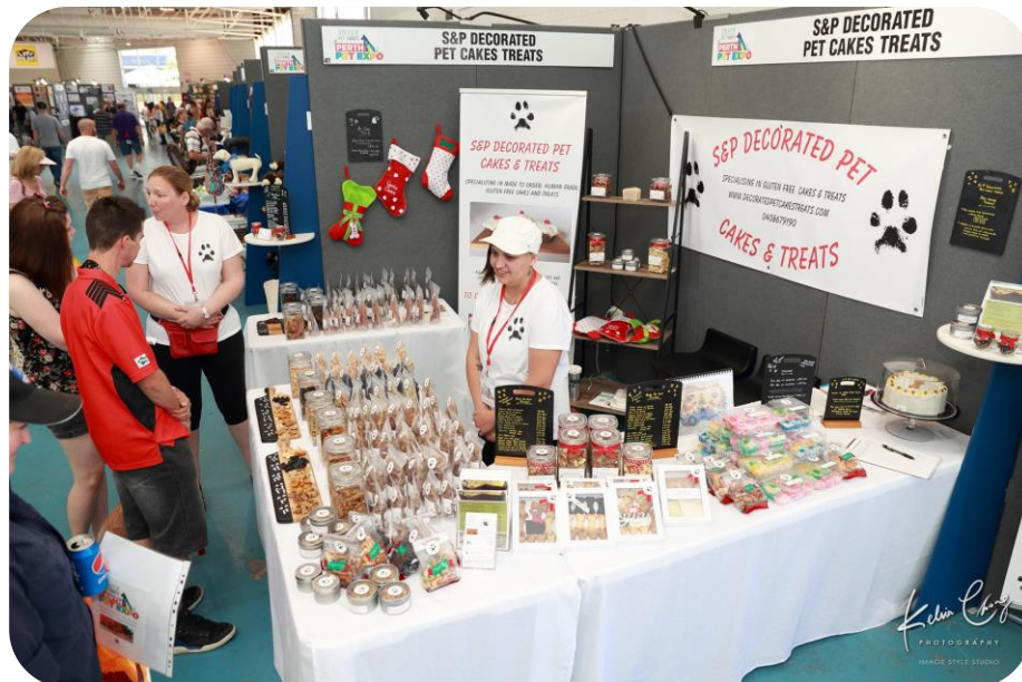
3x2m MEDIUM Exhibition Booth