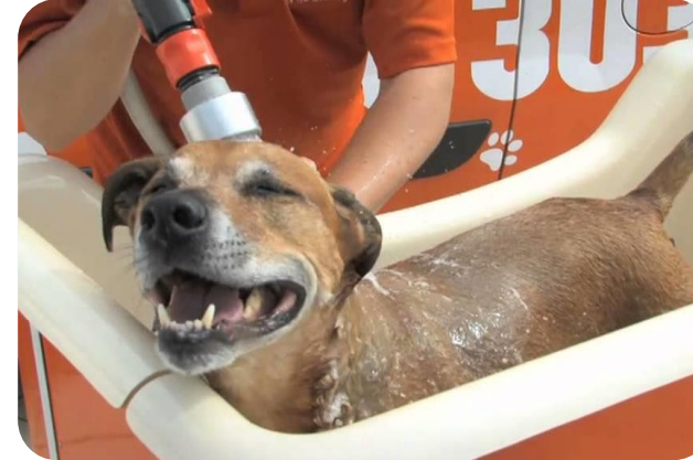
Have your pooch pampered at the City Farmers Dogwash