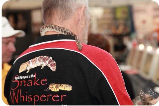
Reptiles on show by The Snake Whisperer