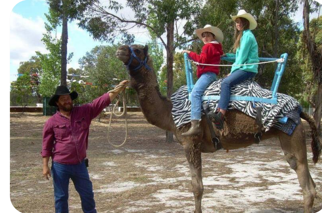
Enjoy Camel Rides with Humpy Camels and kids can ride the “camel train” around the expo!