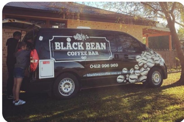
Food Trucks and coffee stands for your human and your pet