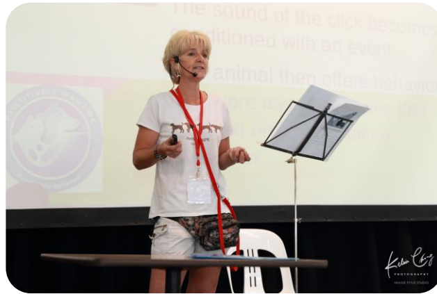
Live Presentations by a variety of animal experts