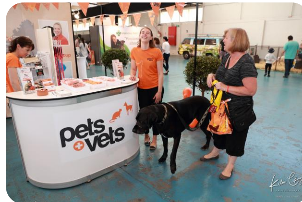
Visit Pets + Vets Group for all your pet's health and wellness needs