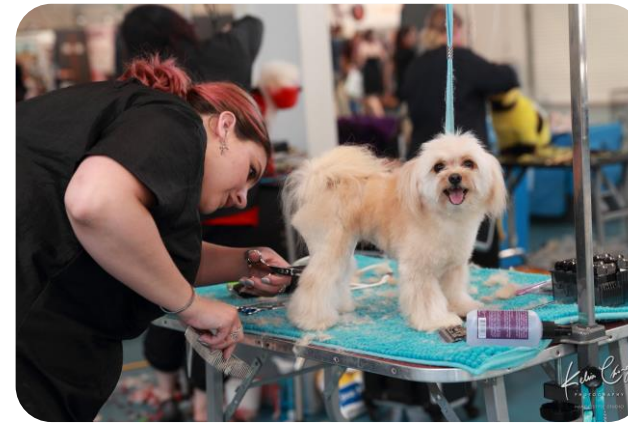
Dog Grooming Competitions presented by PIAA