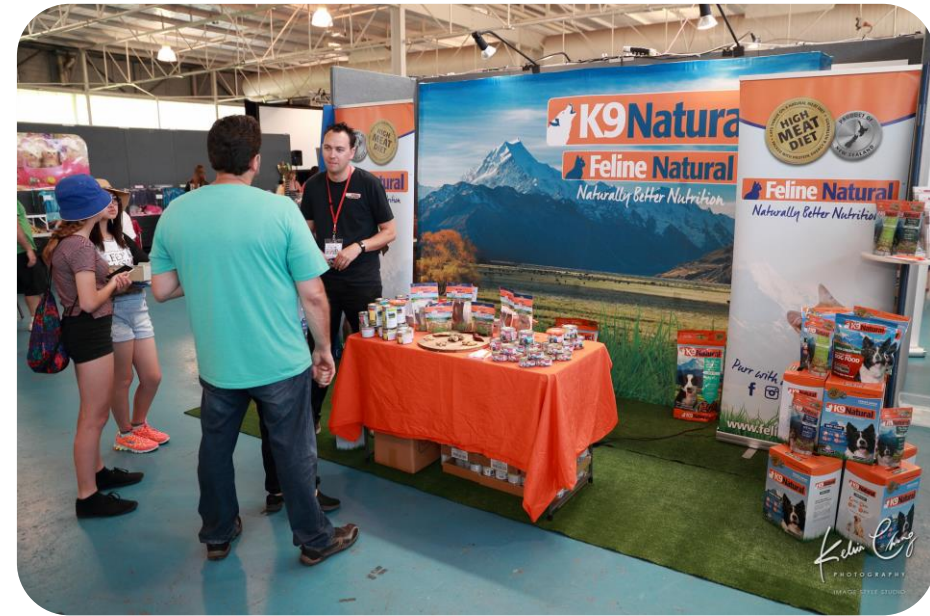
3x4m LARGE Exhibition Booth