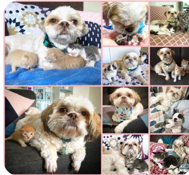
Moon WA's Cutest Pet 2017