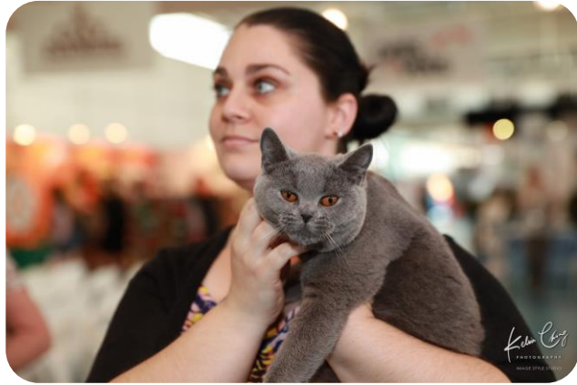
Cat show by ANCATS (Australian National Cats Inc.)