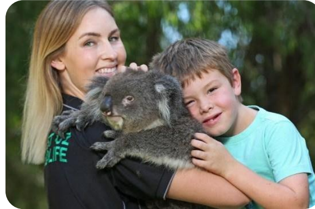
Get up close and personal with a Koala, or pat a dingo at the West Oz Wildlife educational wildlife display