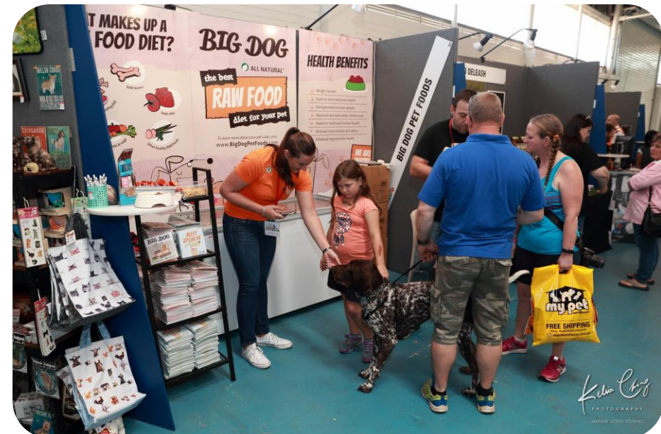
3x1m SMALL Exhibition Booth