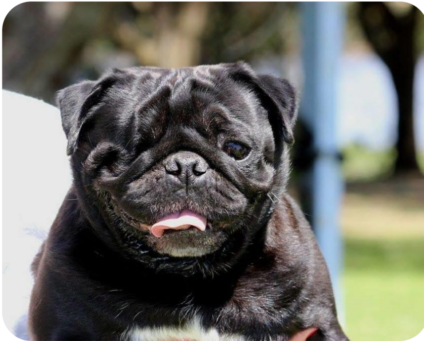
Jack the one-eyed pug WA's Cutest Pet 2016